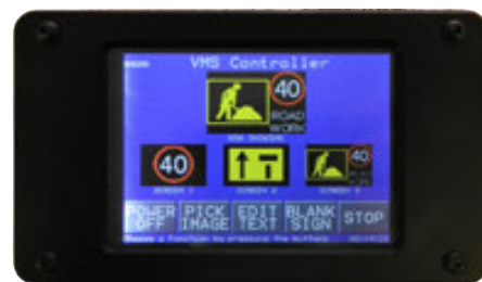
TM405C & TM506C Controller