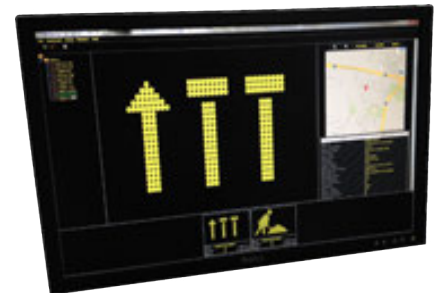
VMS Director Software

Available as an additional feature on the VMS