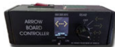
Single or double sided Arrow Board controller supplied