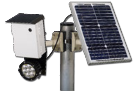
Fully integrated high resolution digital camera

Available as an additional feature on the VMS